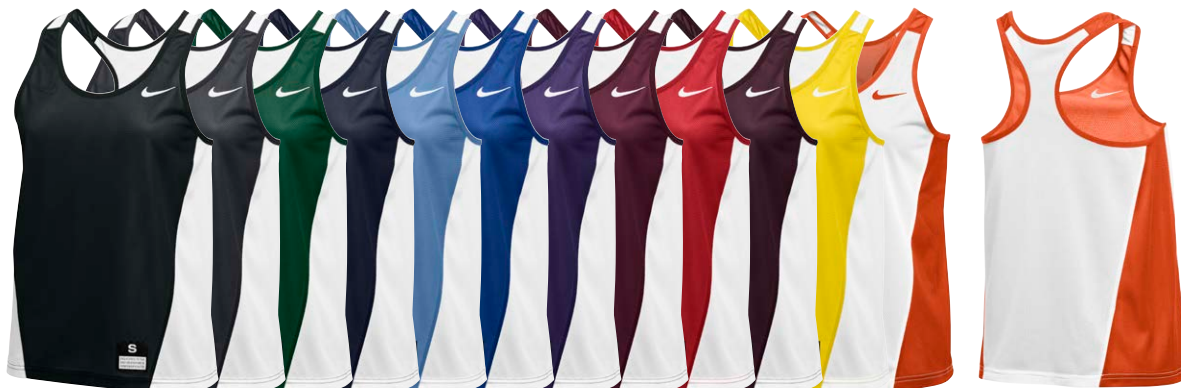
DOUBLE LAYER CONSTRUCTION