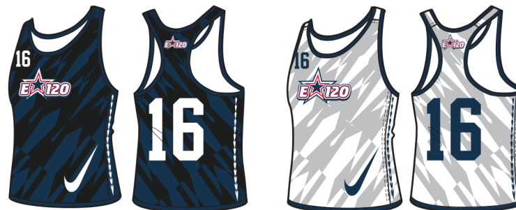
ALL OVER TONAL