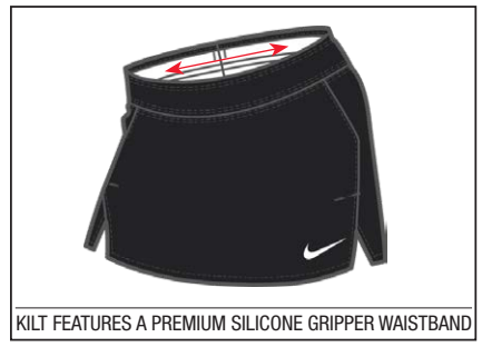
KILT FEATURES A PREMIUM SILICONE GRIPPER WAISTBAND

Fully sublimated Dri-FIT game kilt constructed from lightweight stretch knit fabric. A premium silicone gripper waistband with draw cord is added for maximum comfort, performance, and fit. Kilt does not have a built in compression short. Ability to add team logo or number to lower right leg. Sublimated Swoosh design trademark on lower left leg. Hip width: 21", Front length: 14.5", Back length: 15" (size medium).