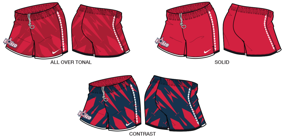
ALL OVER TONAL