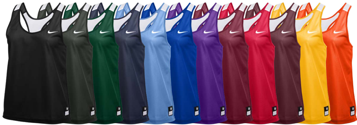
REVERSIBLE DOUBLE LAYER CONSTRUCTION

YOUTH / CW6690 / XS-XL / $20.00 / Body width: 15.75", Body length: 18" (size medium)