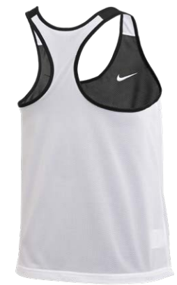
REVERSED BACK VIEW