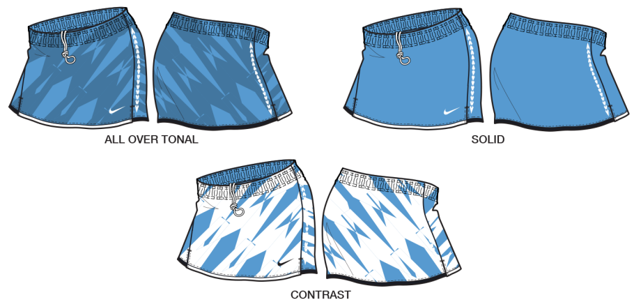
ALL OVER TONAL