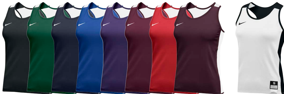
SINGLE LAYER CONSTRUCTION