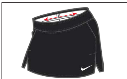
KILT FEATURES A PREMIUM SILICONE GRIPPER WAISTBAND

YOUTH / AH3203 / S-XL / $45.00 / Hip width: 17.75", Front length: 12", Back length: 13" (size medium)